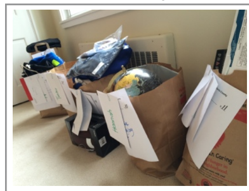
Some of the bags of donations, for the residents at Somerset Home, ready to be delivered