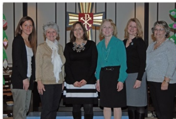
Happy New year from the SJNS teaching staff

This month we open our nursery school to interested visitors. For anyone wishing to inquire about the 2015-2016 school year, please call the nursery school at 908-766-0374, or email the director at jwilliams@sjotm.org .