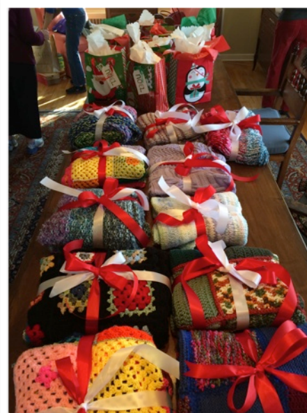
Gifts ready for delivery to the Plaid House girls